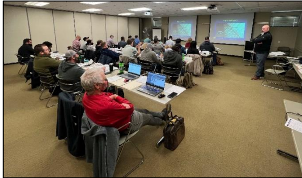
FY22 Classroom instruction, Ft. Sill OK.

Army policy requires every garrison /installation that has bridges, have a Bridge Manager appointed by the Garrison Commander. The garrison/installation Bridge Manager must complete an approved comprehensive bridge inspection training course followed by an approved refresher every 5 years.