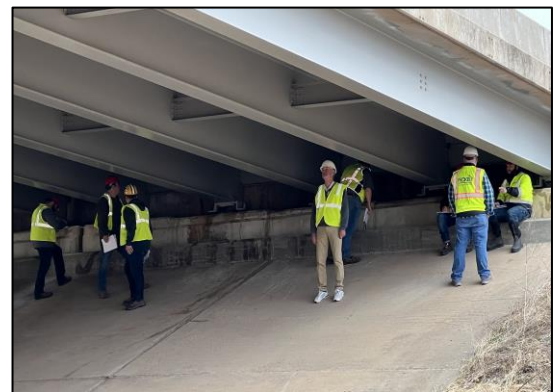
Rating field exercise of I-44 bridge overpass over Howitzer Trail Road at Ft. Sill, OK.