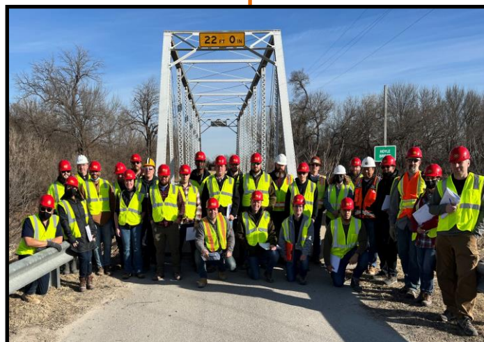
FY22 Class Field Trip, Ft. Sill, OK.